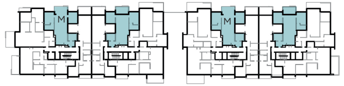
M = Mirror Plan